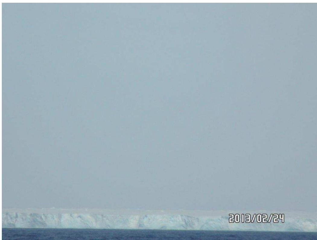
Attachment 1 : Condition for floating ice