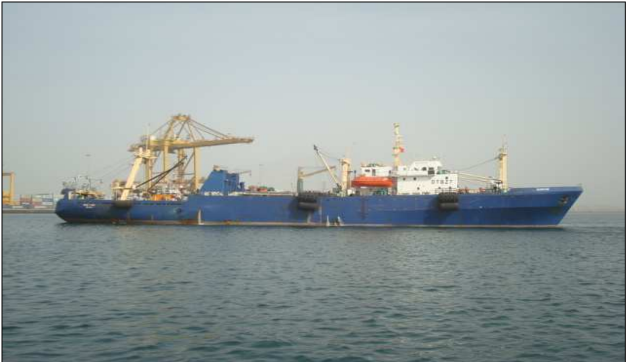
[ADD2 starboard side]