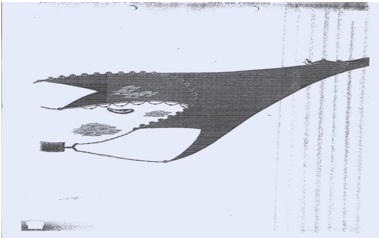
[ADD5 Marine Mammal Protect Net]