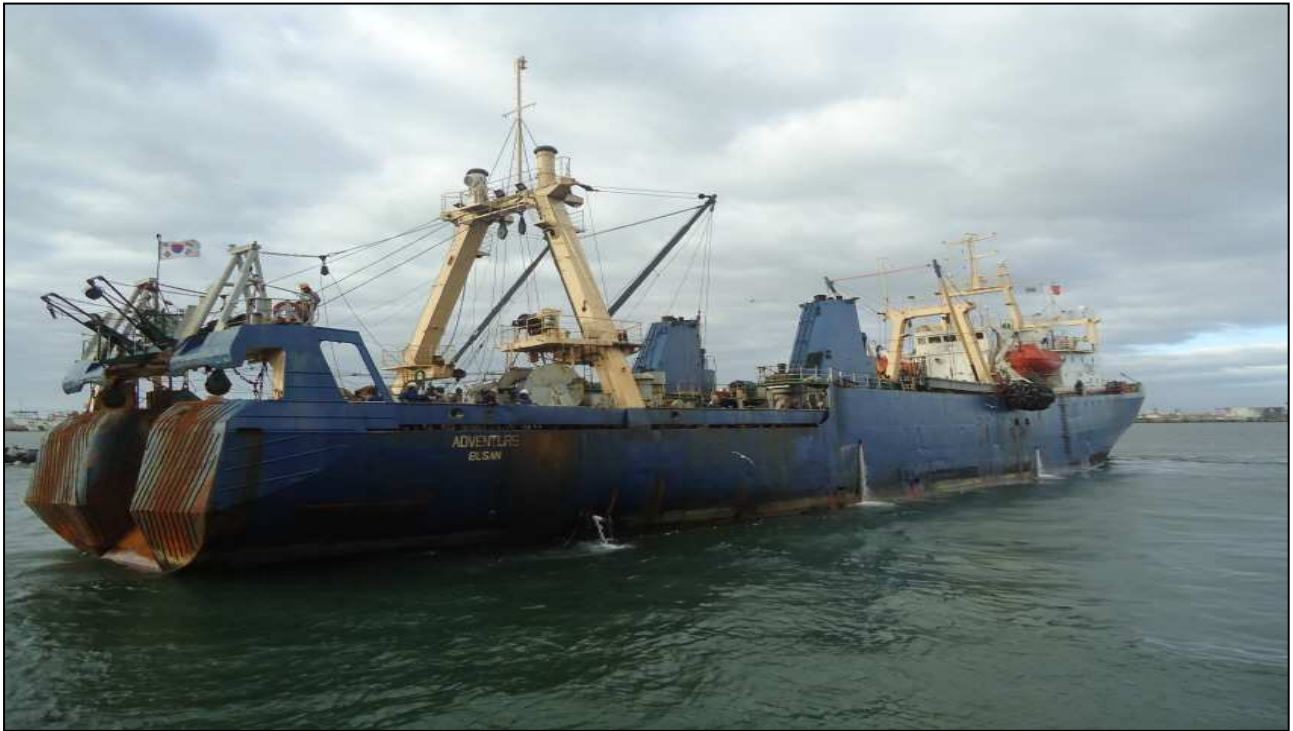
[ADD4 stern view]