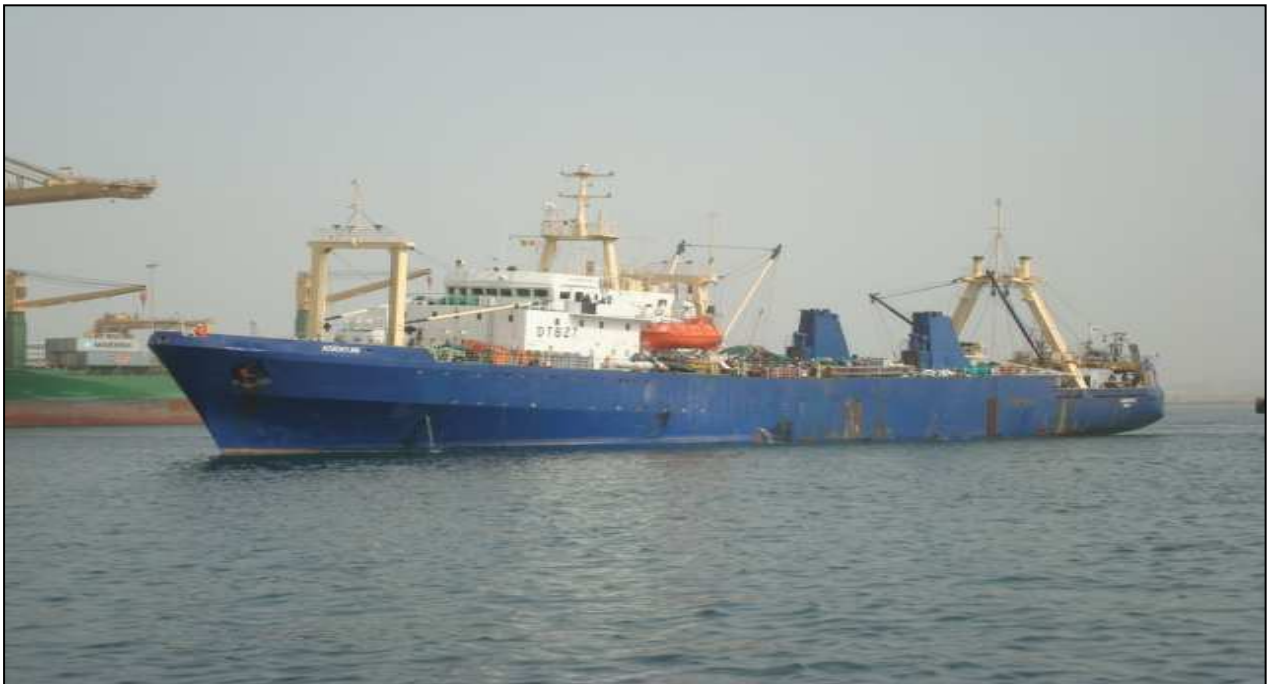
[ADD3 port side]